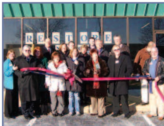
Habitat for Humanity ReStore Ribbon Cutting

Habitat for Humanity of St. Charles County Restore opened Jan. 3. This innovative retail store has both new and used home improvement items and is open to the public. Stop by the Habitat ReStore at 130 Trade Center Drive West in St. Peters or for more information, call 636-978-5712. 🌸