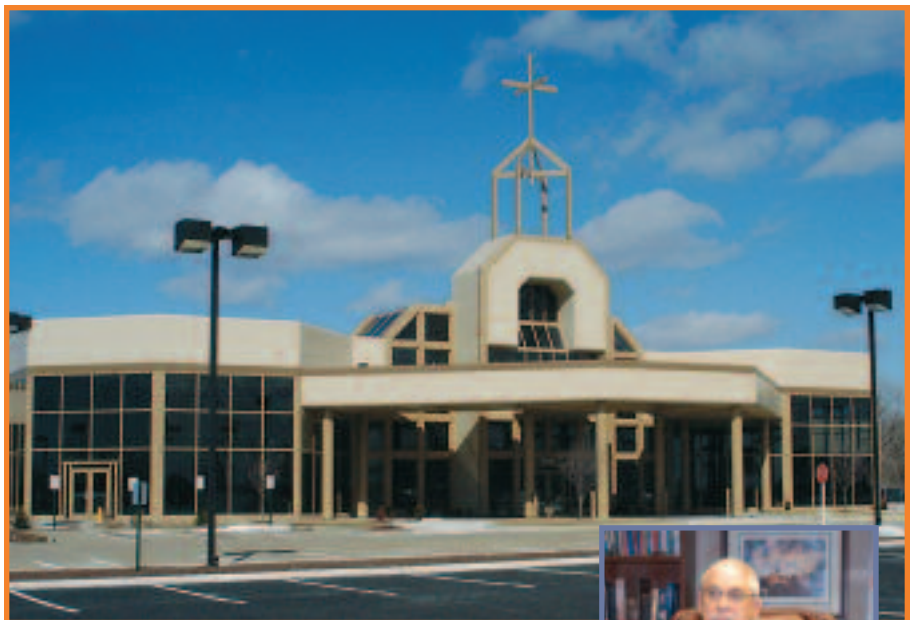
First Assembly of God Church in the former Behlmann Auto Dealership building

First Assembly is particularly devoted to community outreach. For the last four and a half years they have been operating a free daycare program and pre-school for the children of teen parents so that they are able to finish their