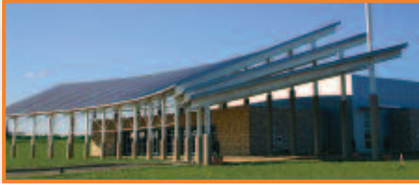
Morning Star Church new Worship Center

There is a lot going on at Morning Star Church...a lot of growth. As soon as the new worship center in O'Fallon opened in July, 2006, it was almost immediately outgrown. Two modular units and more parking had to be added without delay.