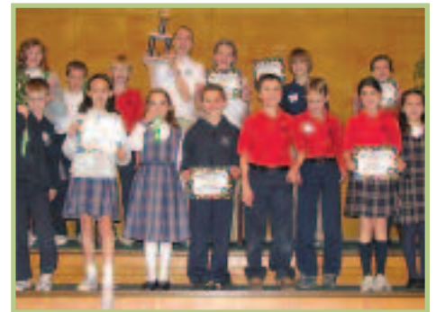
Mathematics Achievement Winners

us a number of times, giving us counsel and advice. It almost feels like we're family. They have also taught us procedures and methodology which have helped improve our accounting practices. I have nothing but praise for New Frontier Bank." 🌸